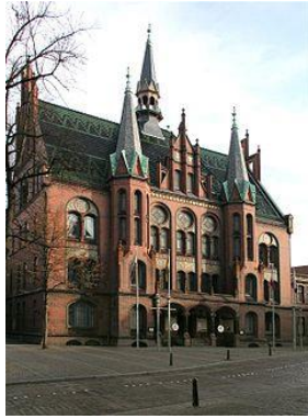
Town Hall/ Rathaus am Großflecken 59