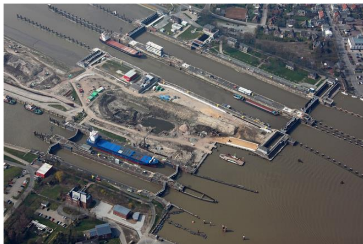
Brunsbüttel: Kiel Kanal