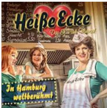
Currywurst/ St. Pauli