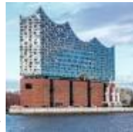
Elbphilharmonie/ Opera House